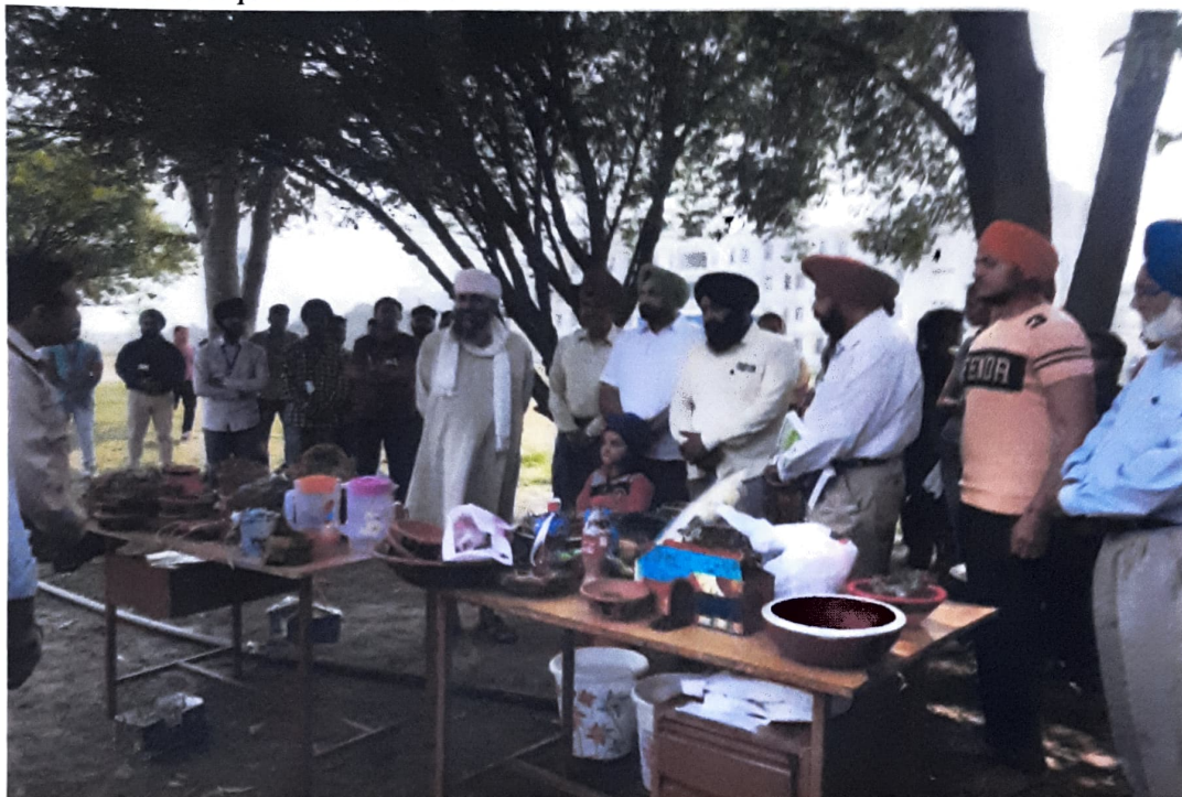
Figure: Water pots displayed in stalls for sparrow