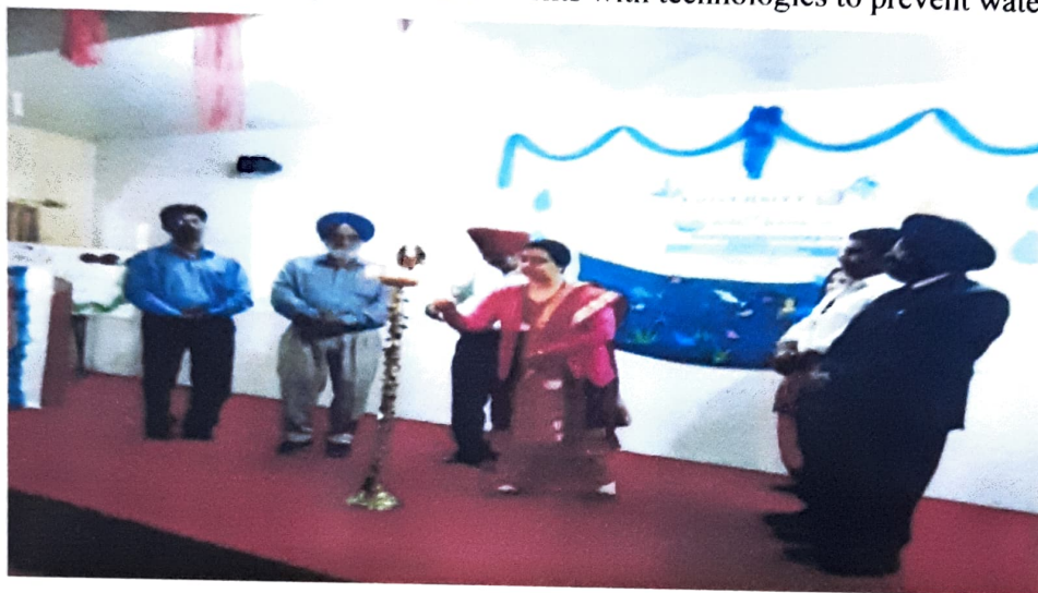
Figure: Lamp Lighting ceremony