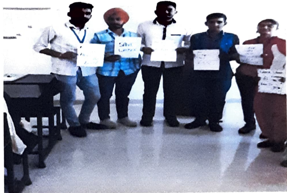
Figure: Poster display by students