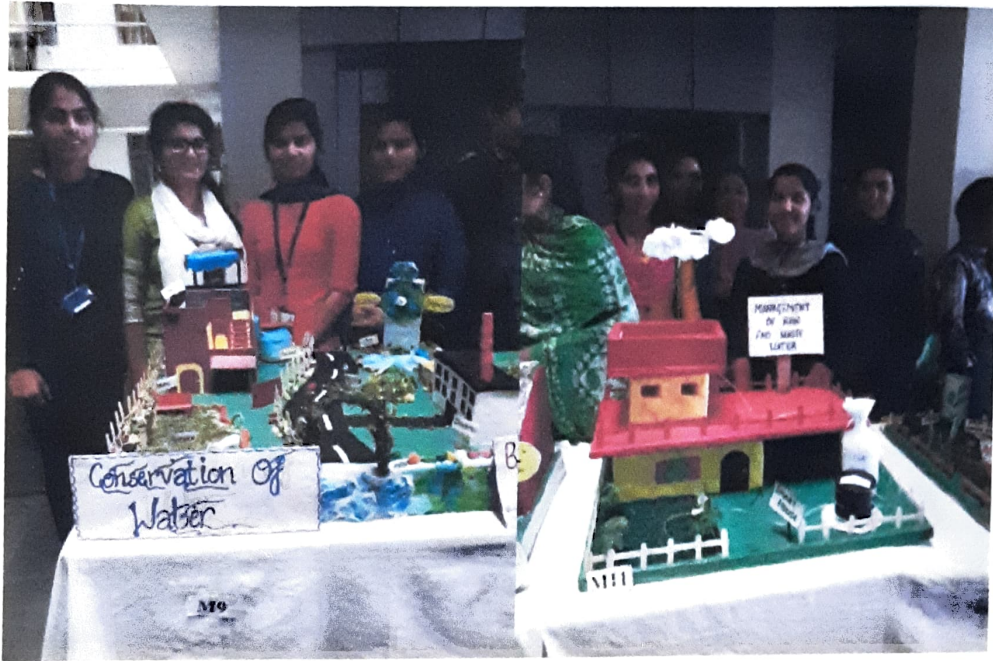
Figure: Model Displayed by the students