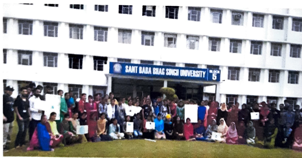
Figure: Students and staff with poster and banner on theme water conservation