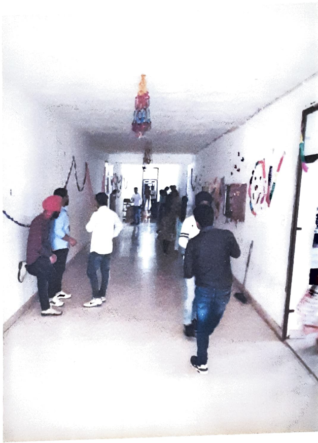
Figure: Baisakhi Celebration