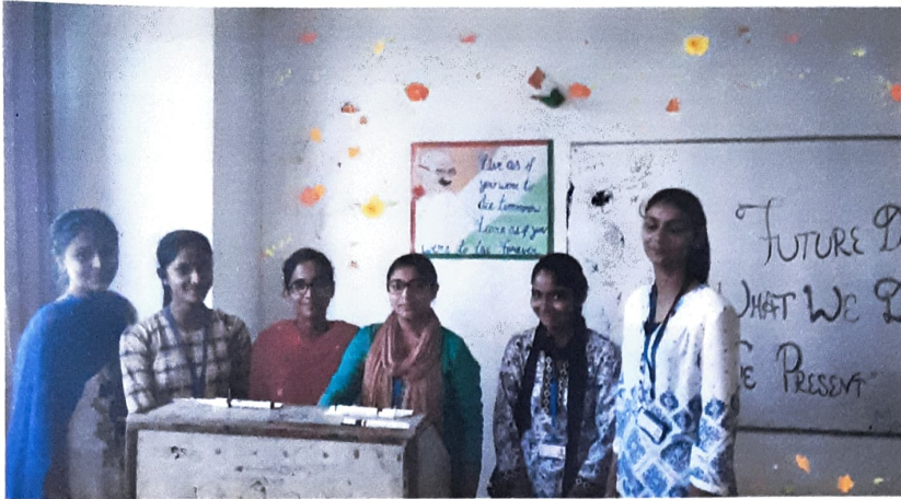
Figure: Gandhi Jyanti celebration