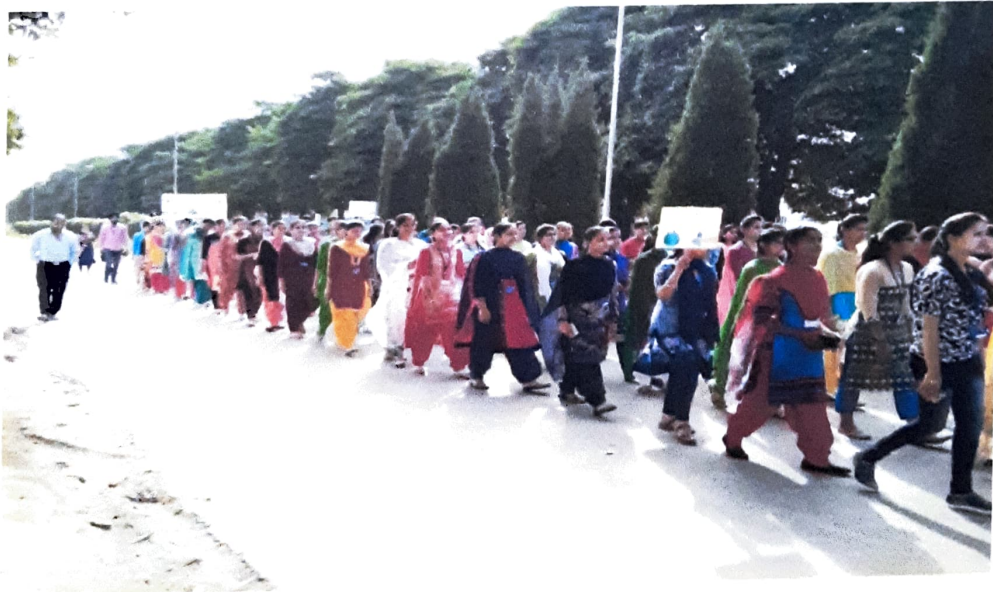
Figure: Rally for water conservation inside the campus