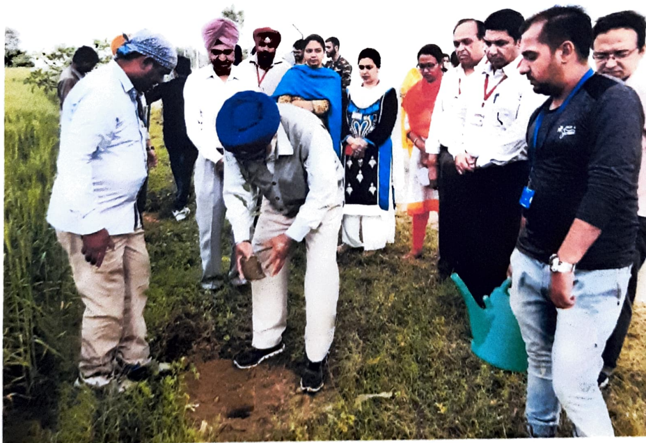
Figure: Plantation activity done by management of the university