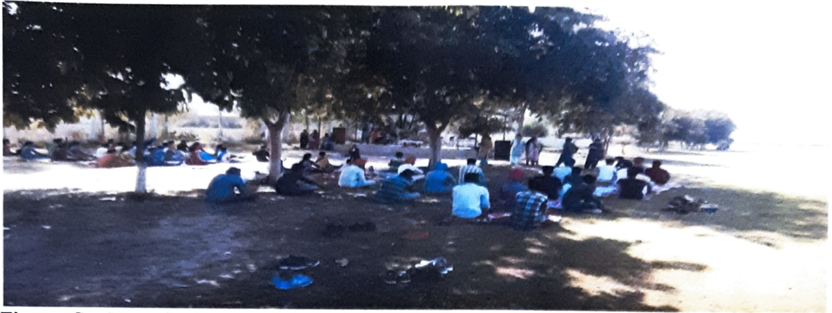
Figure: Students. Staff and faculty members performing Yoga Asanas