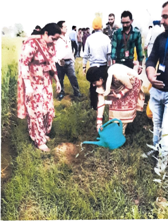
Figure: Plantation done by the faculty